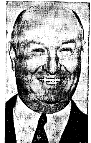
Hon. James A. Farley